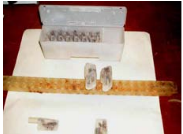
JZBZ's cages with banking bar and mailing box