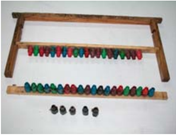
Plastic queen cells, bars and holders

A number of three to five frame nucleus boxes will be needed for starting cells and mating queens. If using the 'Swathmore' method, you will need a three to five frame nucleus box with a fully vented or screened bottom with 25 mm to 50 mm riser between the box and bottom.