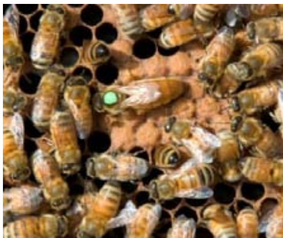
A marked Italian queen bee (green dot on thorax)

A queen is slightly larger than a worker bee, having a large pea-size thorax and long tapered abdomen. She differs from the other female bees (workers) in that her reproductive organs are fully functional, while those of the worker bees are not. There is usually only one mature queen in the colony at a time and she is responsible for reproduction in the colony. A mature queen may lay up to 2000 eggs a day in bursts, but averages 700–1000 a day when conditions are favourable. A queen can live for several years, although under commercial conditions she is usually replaced every 1 or 2 seasons to ensure her vigour, which translates to colony health. After emerging from her cell, she mates on the wing six to ten days later with up to 20 drones. She will not mate again after she begins laying eggs.