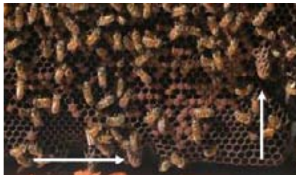
Natural emergency cells raised by queenless hive

Swarm cells are raised by a colony intending to swarm. The bees prepare special queen cell cups in which the queen lays eggs. Virgin queens emerge about two days after the swarm (half the colony, including the old queen) have departed. Young larvae in swarm cells are very well fed with royal jelly and queen bees produced from swarm cells are usually larger than queens produced from emergency cells. A colony will prepare 15 to 25 swarm cells, usually around the edges of the brood combs, often overhanging the bottom bar of the frames.