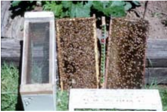
Swathmore swarm box

place the frame containing the grafted cells between the frames of honey and pollen. A few bees may escape.