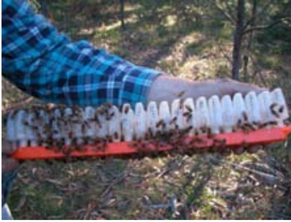
JZBZ banking bar with cages