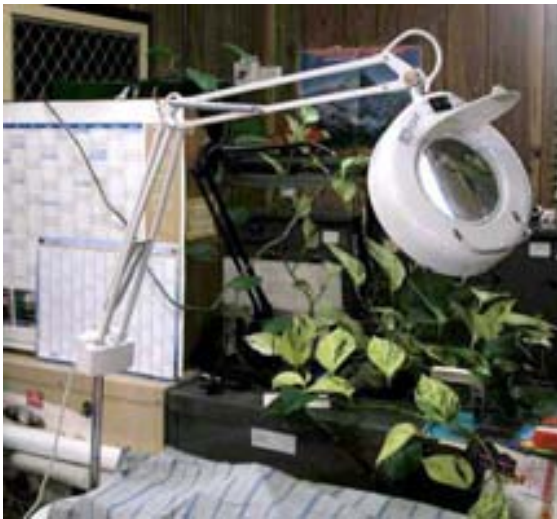
A magnifying lamp to help grafting

Next place the bar of 20 cells or less into the feeder hives. Accepted cells may be moved from one bar to another to make up 20 cells.