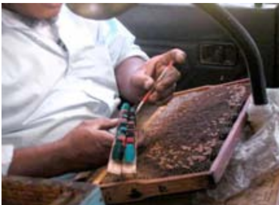
Grafting using a Chinese grafting tool

The safest way to transport cells is in a nucleus box with honey, pollen and bees. Make sure no queen is present, or your queen cells may be destroyed.