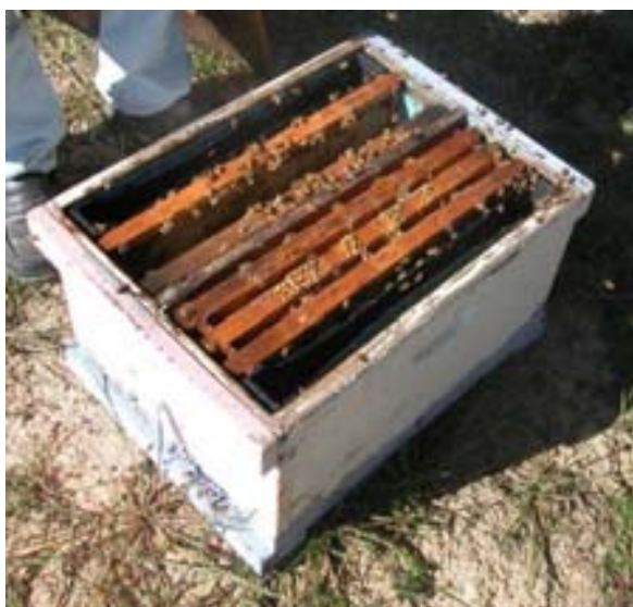
6-way ideal depth mini mating nucleus (note the queen cells placed between frames)

If young virgin queen bees are allowed to emerge together they will attack each other and destroy unhatched queen cells. To prevent this occurring, introduce queen cells on the tenth day after grafting (i.e. 1–2 days prior to emerging) into individual queenless colonies.