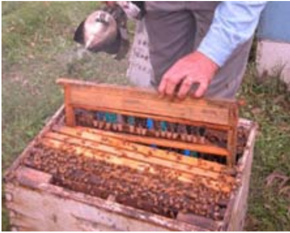
Removing ripe cells from cell builder