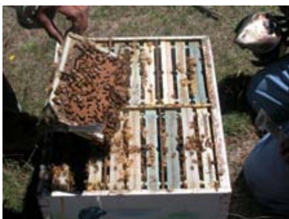
A standard 10-frame hive split into 2 x 4-frame nucleus colonies (note the plastic sugar feeders)

A small colony called a nucleus is normally used for mating queens but queen cells can be placed directly into productive queenless colonies. A wide range of designs of mating nuclei are in use. Some are specially designed for queen rearing and are based on half length and shallow depth frame sizes. For small beekeepers, standard full-