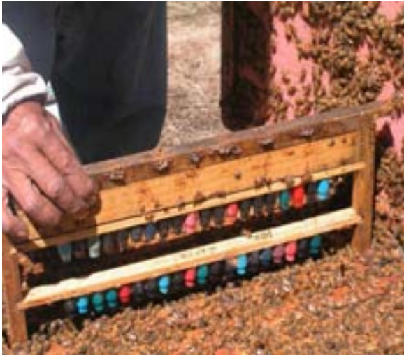
Placing grafted cells into a starter hive

When grafting more than one bar, wrap the grafted bars in a moist towel to prevent dehydration until ready to place bars into holders and into starters.