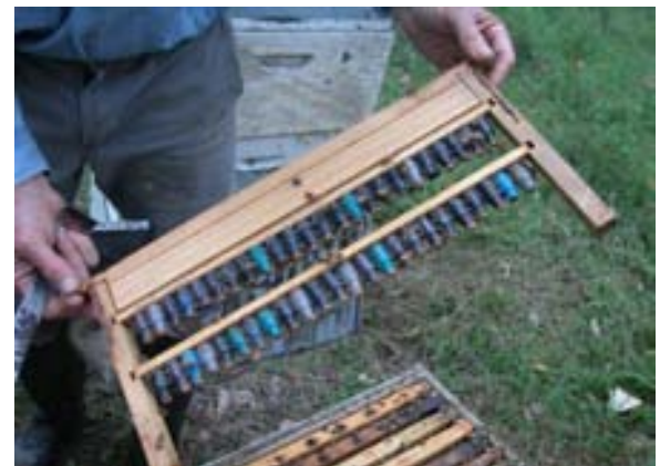
Checking a graft the next day