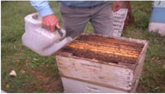
Wooden frame sugar feeder