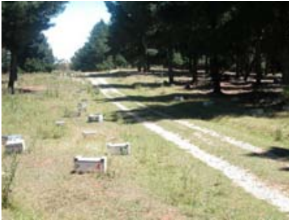
A well protected, spaced out mating apiary

removed and replaced with a new ripe queen cell. Alternatively, the nucleus can be united to a hive to be re-queened. Current research indicates that queens that are caught 28 days after emerging from the cell and caged for mating are less likely to be superseded than younger queens when introduced into a new colony.