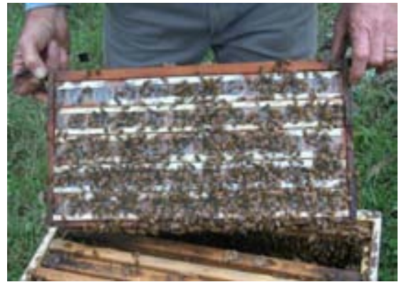
Five wooden bank bars holding 10 queens each

Queen bees are banked in individual cages without escort bees in queen-right hives above an excluder or in queen-less hives. Hives used for banking queens should be strong, disease free and be fed pollen and sugar syrup, and have frames of sealed brood added on a regular basis to maintain large numbers of young bees in the colony.