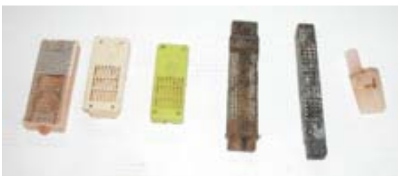
A range of mailing and introducing cages

Papering on a nucleus hive is done by killing the old queen in the brood box and then shaking all the bees out of the second box, placing two sheets of newspaper between the two boxes, and then adding contents of the nucleus colony, making up the balance with frames from the old hive. A variation of this used by commercial beekeepers is to paper a single box with a young queen on top of the old hive and allow the bees to unite; 90% of the time the young queen survives and the old queen is killed.