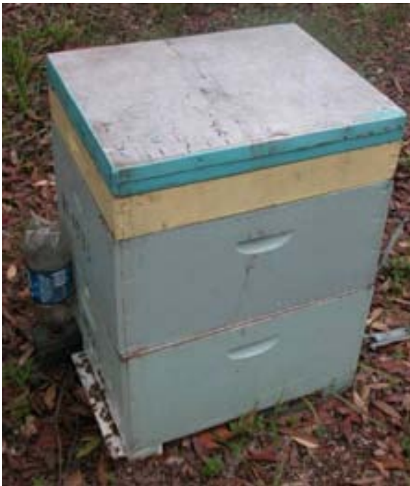
Wooden block entrance sugar feeder

Pollen can be provided by placing a quantity of powdered pollen on a small sheet of tin or board directly over the area of the colony containing the queen cells. Provide more pollen as it is removed by the bees.