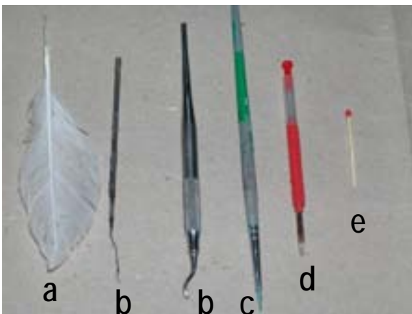
Examples of grafting tools

Grafting out of dark combs assists in seeing the very small larvae, as will the use of a cool light or magnifying lamp (e.g. x10 magnifying lamp as used by craft people). The use of a room out of direct sunlight will ensure that larvae don't dry out and improve success rates.