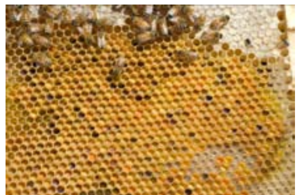
A frame of fresh pollen from three plant sources

Strong, disease and pest free active colonies of bees are essential for rearing good quality queen bees. Two or three-deck colonies are used, they should have six to eight frames of brood and at least two boxes full of bees. Queen excluders will also need to be fitted.